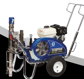
DUTYMAX™ GH300DI STANDARD