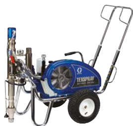
DUTYMAX™ EH230DI STANDARD