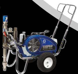
DUTYMAX™ EH300DI STANDARD