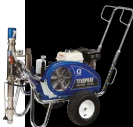
DUTYMAX™ GH230DI STANDARD